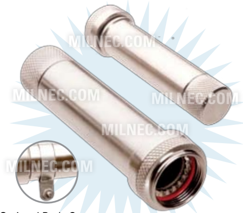
Optional Body Strap with Bolt Attachment

EV Series • MIL-DTL-83723 Series III Type Connectors