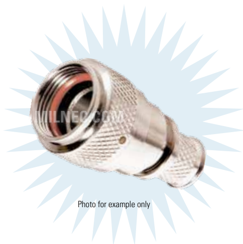
Photo for example only