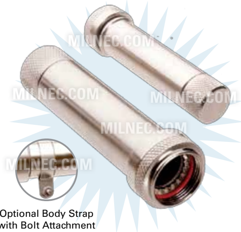
Optional Body Strap with Bolt Attachment

TX Series • MIL-DTL-38999 Series III Style Connectors